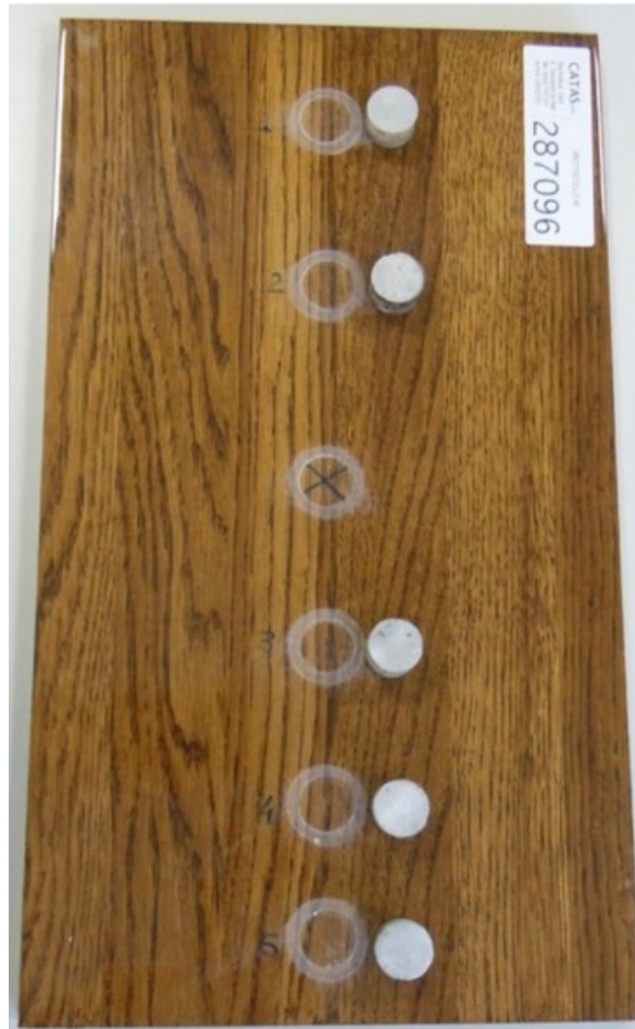
- Sample at the end of the test -

TE 258 (tinta) + IPA430 (isolante) C330 20% + KY35 (Kemiyacht 35) C330 30% + KY100 (Kemiyacht 100) C330 40%